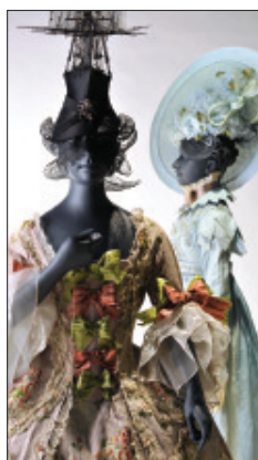
Costumes featured in the 'Dressed to Impress' tour.

Meanwhile, 'These are a few of my favourite things...' will see